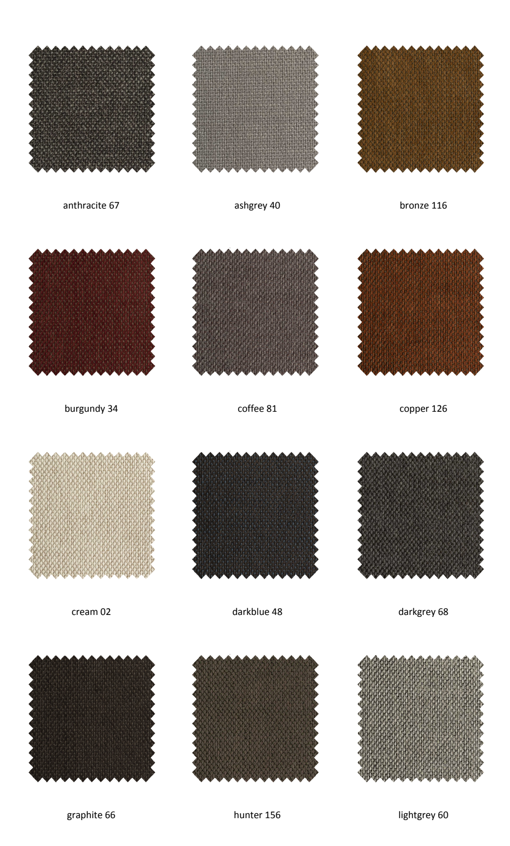
Please note: colours may vary according to your screen settings.